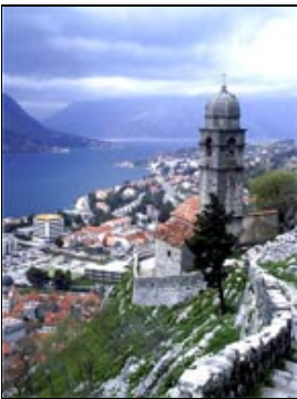
Kotor, Montenegro (by guerretto)