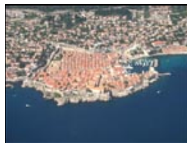
Dubrovnik, Croatia