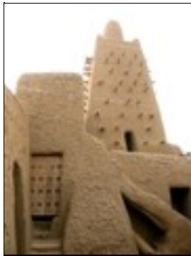
Timbuktu, Mali