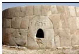
Hili National Archaeological Park

Monuments Fund/Knoll Modernism Prize. Awarded in summer 2010, the prize is given to a design professional or firm in recognition of an innovative design solution that preserves or enhances a Modern landmark. The deadline for nominations is March 31, 2010. Please write to the modernism@wmf.org for the "Call for Nominations" flyer describing the steps and requirements for submissions or with any other questions you may have.