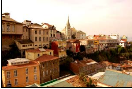
Valparaiso, Chile