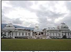
National Palace, Haiti