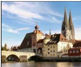
Regensburg, Germany (Public Domain)