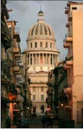
Old Havana, Cuba

http://www.unece.org/hlm/wpla/workshops/call.4.presentations.dessau.pdf