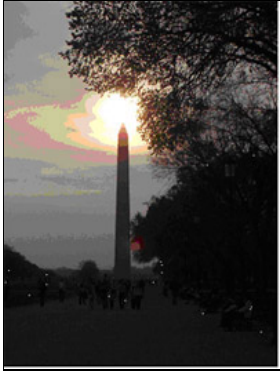
The US/ICOMOS Secretariat is located in Washington, DC