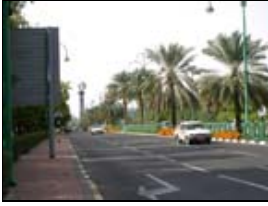
Street in Al-Ain