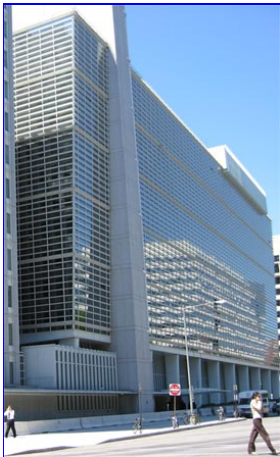
The World Bank Headquarters in Washington, DC