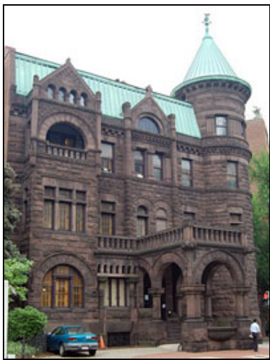
Heurich House (Brewmaster's Castle) - the new home of US/ICOMOS on September 1, 2013