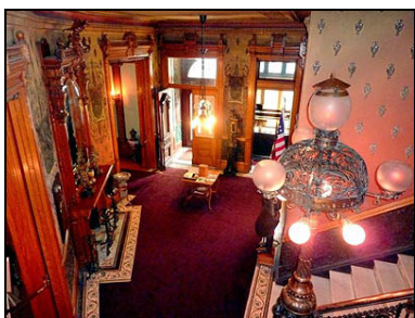
First floor of the Heurich House