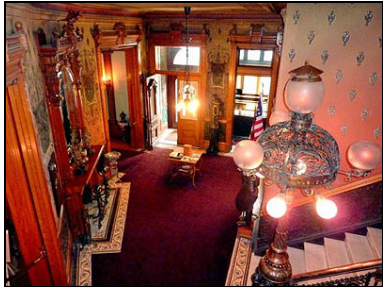
First floor of the Heurich House

1307 New Hampshire Avenue, NW Washington, DC 20036