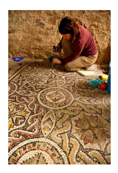
The Getty Conservation Institute is recipient of the 2011 Ann Webster Smith Award for International Heritage Achievement