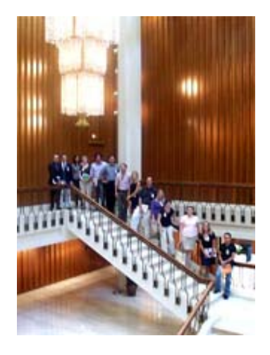
The 2010 class of the US/ICOMOS International Exchange Program at the World Bank in Washington, DC