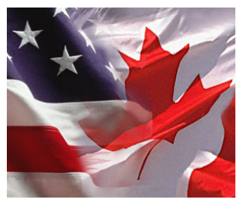
US/Canadian Heritage Cooperation will be the theme of the US/ICOMOS International Breakfast, to be held October 21 in Buffalo, New York