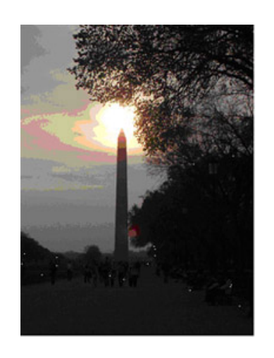
The Washington Monument sustained damage from the August 2011 earthquake

This year's US/ICOMOS International Breakfast at the 2011 National