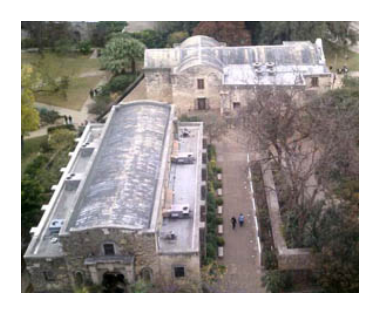
The Alamo, part of the US Tentative List nomination of the San Antonio Missions to the World Heritage List, will be featured at the 15th US/ICOMOS International Symposium, May 31-June 2, 2012 in San Antonio, Texas