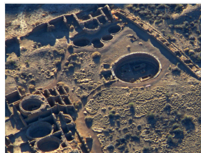
Chaco Culture National Historical Park.

We are very pleased to announce that the current administration has undertaken steps to better protect Chaco Culture NHP/WPS and its surrounding landscape. US/ICOMOS has advocated for this for the past several years in partnership with Pueblos, Tribes, concerned citizens and many other heritage organizations. Learn more about the historic and sacred Chaco landscape and the threats to it in our 2020 World Heritage Webinar devoted to the topic.